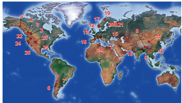
Current INARCH mountain research basins.

France: 12. Arve Catchment; 13. Col de Porte Experimental Site; 14. Col du Lac Blanc Experimental Site Germany: 15. Zugspitze Basin and Schneefernerhaus Research Station Nepal: 16. Langtang Catchment Norway: 17. Finse Alpine Research Centre Spain: 18. Izas Research Basin Sweden: 19. Tarfala Research Station Switzerland: 20. Dirschma Research Catchment; 21. Weissfluhjoch Snow Study Site; USA: 22. Dry Creek Experimental Watershed; 23. Grand Mesa Study Site; 24. Reynolds Creek Experimental Watershed; 25. Senator Beck Basin Study Area; 26. Sagehen Creek, Sierra Nevada.